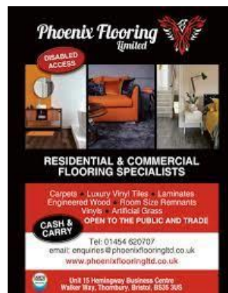
Phoenix Flooring Ltd