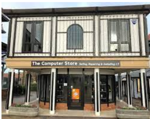
The Computer Store in St Mary's Walk